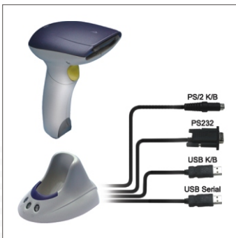
Cable replacement solution for Legacy Output (PS/2 keyboard, RS 232, USB keyboard and USB Serial )