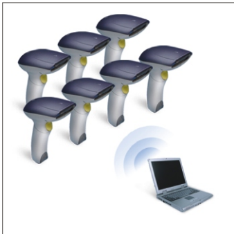
Support up to 7 connections with h USB Bluetooth dongle or Bluetooth devices