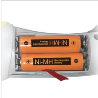
Rechargeable AA Size high capacity Ni-M H battery